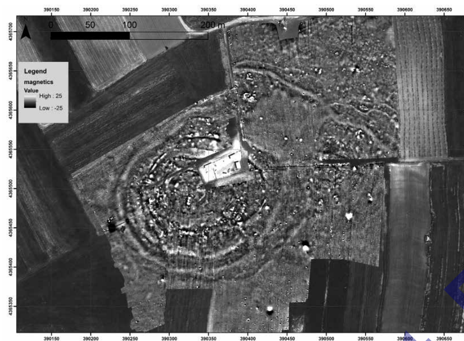
Fig. 3. Magoula Rizomilos 2. Results of the magnetic survey superimposed on a GeoEye-1 satellite image taken on May 4, 2010. The satellite image is a pansharpened Intensity-Hue-Saturation combination. A second smaller similar tell is suggested to the east of the settlement. To the north, the magnetic signature and the satellite data indicate traces of past flooding activity. According to the locals, the region used to be flooded regularly in historical periods.

Rondiri 2004: 24–38), diverse usage was demonstrated on the mound, which was roughly 50 m in diameter. The clustered dwellings were clearly separated by an open/empty zone. In some cases, the nucleus of the tells was surrounded by small enclosures and the limits of the settlements were defined by a larger system of outer multiple ditches, usually of circular shape, all of which bear evidence of multiple entrances. At Almyros 2, an unoccupied area was identified between the nucleus of the tell and the outer ditches to the north, contrasting with the southern part, which seems to have been densely occupied (Fig. 1).