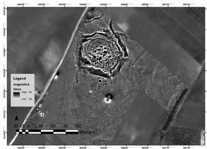
Fig. 1. Results of the SENSYS MX magnetic gradiometer survey at the Almyros 2 Neolithic tell